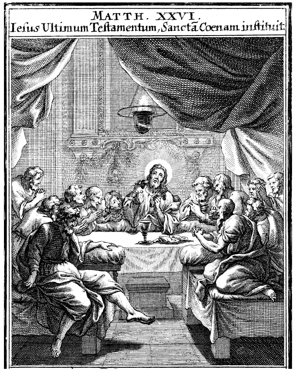
Woodcut illustration from a 1695 Bible – Matthew 26 Jesus initiates the Eucharist at the Last Supper on Maundy Thursday evening.

Our Savior Lutheran Church SL Lakeland, FL ⊀ ELS Lent ~ Maundy Thursday ♥ ( The Lord's Supper ) March 24<sup>th,</sup> 2016 \vert 7:00 pm